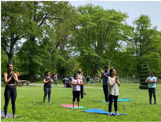
Indo-Canadian Association of Nova Scotia organized a Yoga Awareness Event at the iconic Halifax Public Garden to popularize yoga.