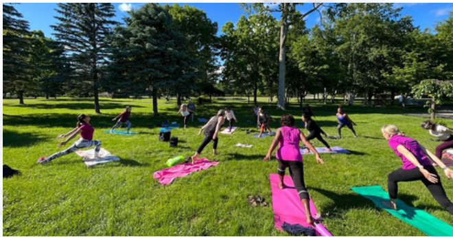
Consulate in association with AIC Group and Indian Community Fredericton organized a special event for yoga enthusiasts at New Brunswick.