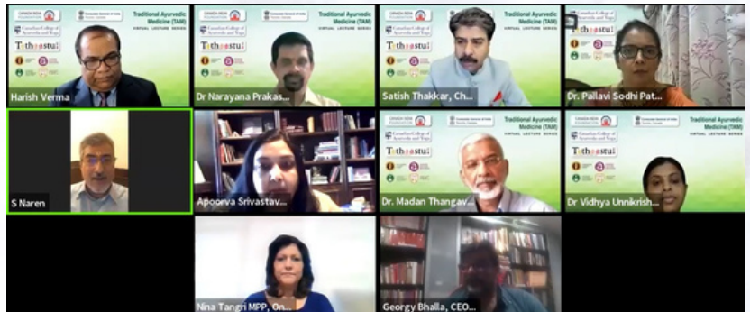
Consulate in association with Canada-India Foundation (CIF) organized a virtual session with Sister Shivani on the topic "How do you find stillness in the busy-ness of life."